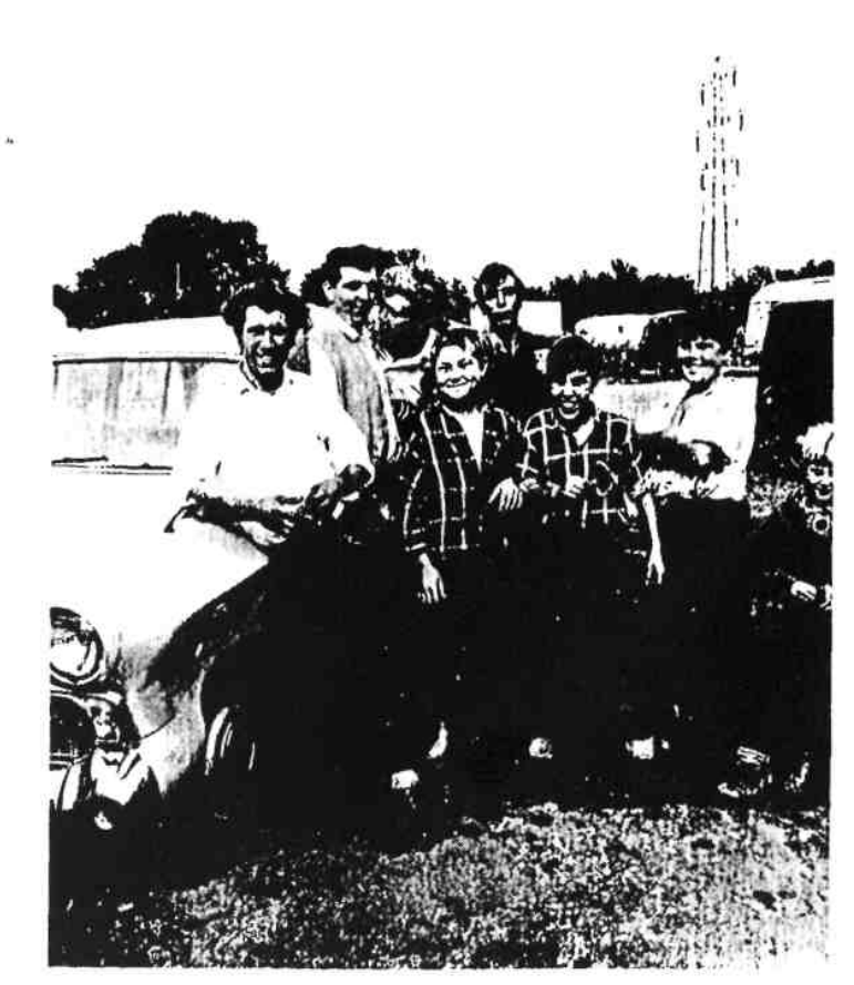
English Gypsy men and boys.

This survey set the tone for other local authorities. The fiction of the 'full-blooded' Romany was used to condemn the majority, if not all of the Gypsies in the locality, and even to justify making no site provision when the 1968 ruling required it (see Okely 1975a:33). In practice of course it has been impossible to identify 'Romanies' by their physical or 'racial' features. The physiognomy of the majority of Gypsies is very